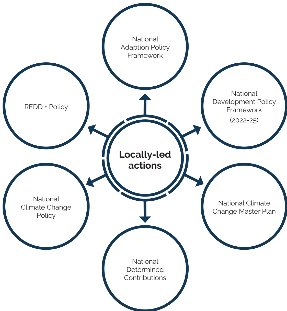
Figure 3: Illustration showing how local adaptation cases align with some climate policies, strategies, and frameworks

Findings from the research further highlights that locally-led adaptation aligns seamlessly with a nation's climate priorities, including those outlined in NDCs and the National Development Policy Framework (see Fig. 3). This synergy ensures that local actions contribute to achieving national climate goals. In particular, as local communities become more resilient to climate impacts, there is a ripple effect on national resilience, such that strengthening the resilience of individual communities contributes to the overall resilience of the nation.